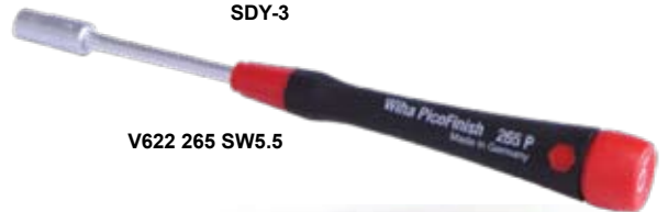
V622 265 SW5.5